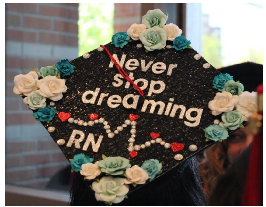
Rutgers School of Nursing Graduation 2016

You may also submit a Student Aid Report (SAR) if you wish financial need to be considered when your